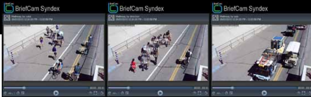
Refine by color