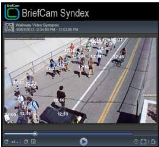
Video Synopsis is the simultaneous presentation of objects, events and activities that occurred at different times.

BriefCam Syndex FS+ is intended for law enforcement and/or security officer teams: multiple users responsible for the post-event and/or routine review of an unlimited number of video files for investigative purposes, as an individual, group or collaborative effort.